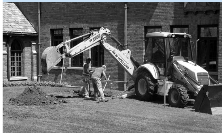
▶ Workers and equipment at the construction site get the project underway.