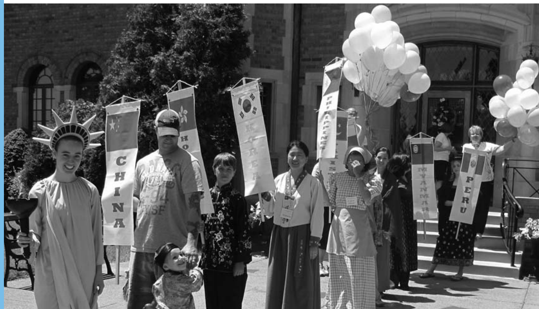
▶ A colorful parade featuring costumes and banners depicting the Columban Sisters worldwide missions was one of the highlights of the Spring Festival activities.

Each issue of St. Columban's Today features a special insert which highlights an area where the Columban Sisters minister and gives you a firsthand glimpse of how your support helps those less fortunate.