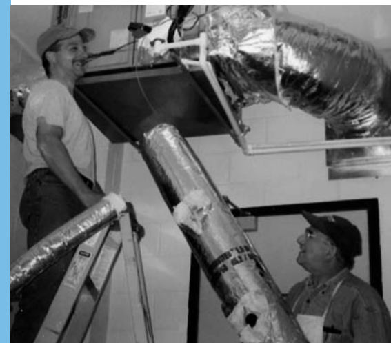
▶ Installation of one of the main air conditioning units under the watchful eye of our plumbing contractor.