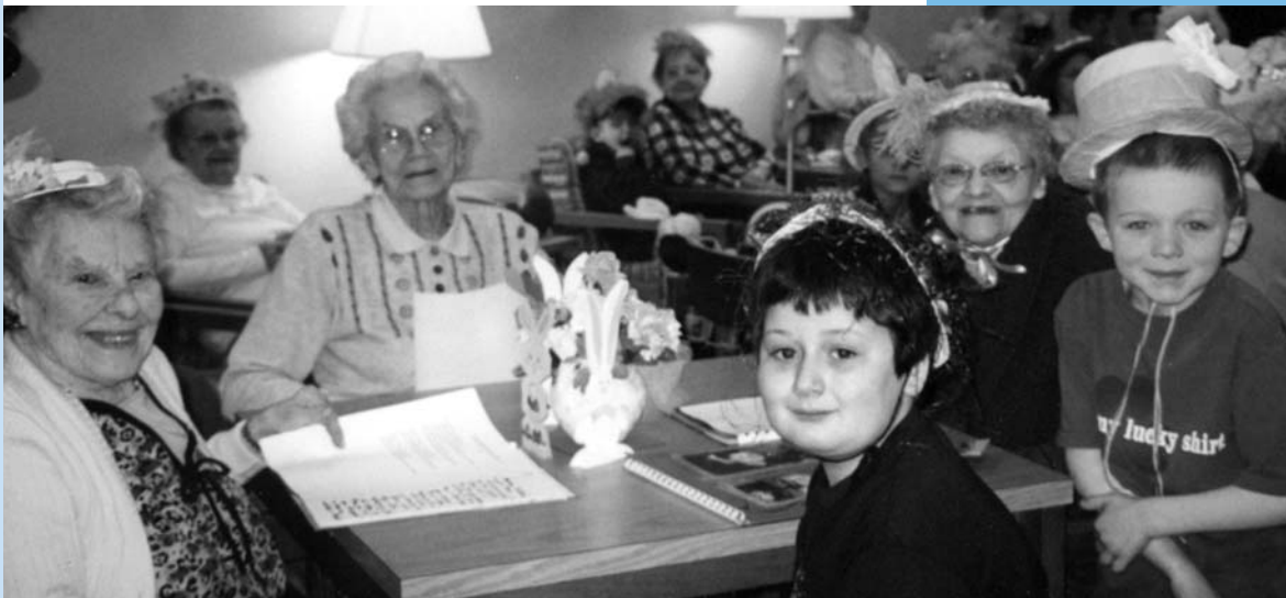
▶ Pen Pals, young and old, enjoy conversation before the Easter Egg Hunt.