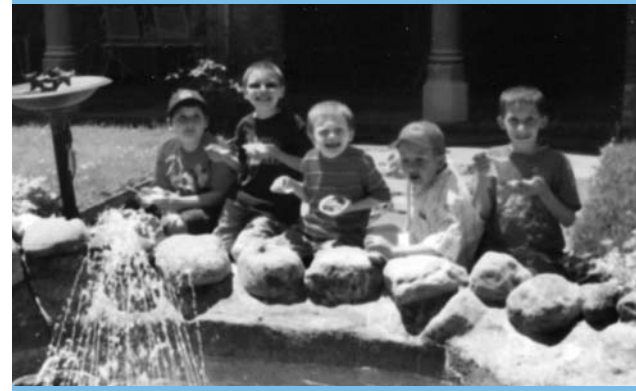
▶ Young Pen Pals at the fountain in St. Columban's courtyard.