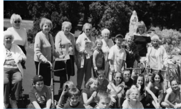
▶ Pen Pals of all ages gather at the Ice Cream Social.